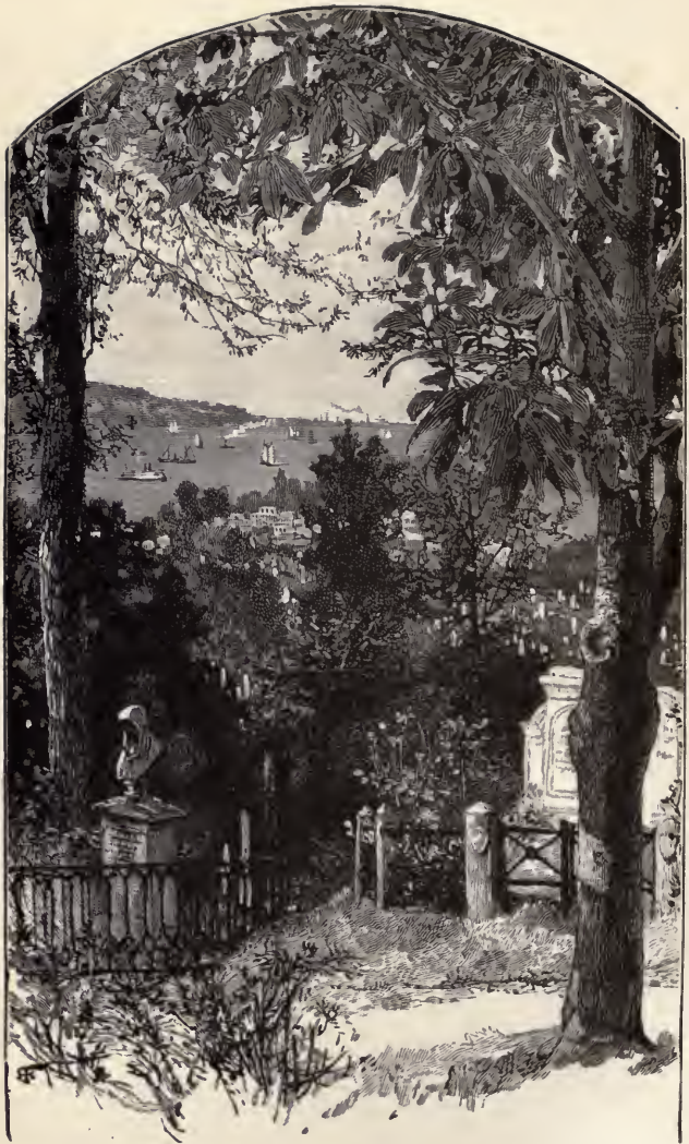
GREENWOOD CEMETERY, BROOKLYN.